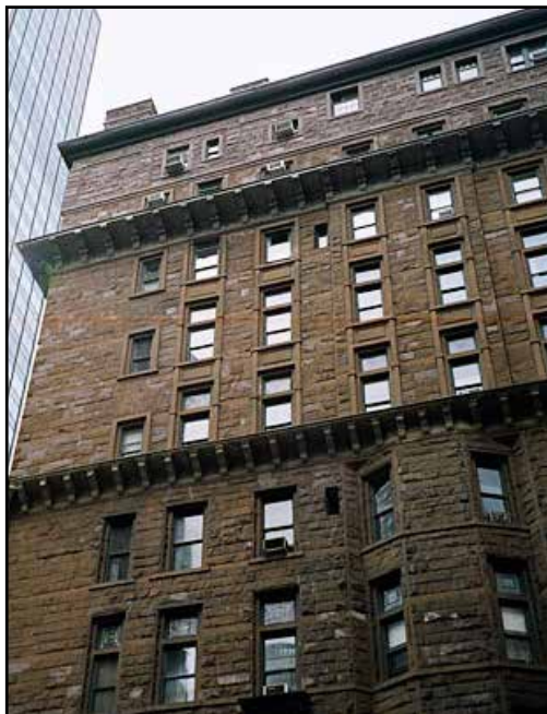
◀ The Osborne Apartments