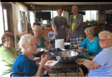
Pre-parade Plum Cake Preparation!