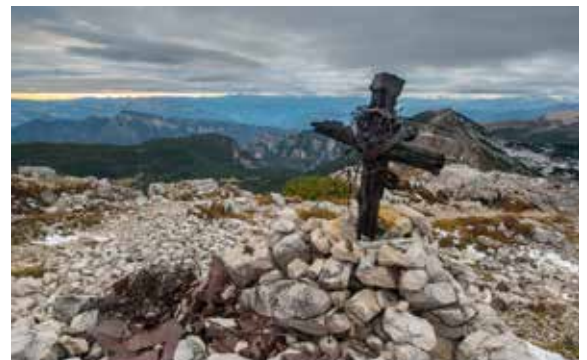
A cross marks the Austrian line in the Pasubio mountains, a relic of their 1916 "Punishment Expedition."