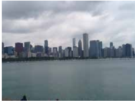
Chicago skyline from Lake Shore Drive

Monday, Labor Day sent the delegations off with a farewell Mass. Now, New York is busy getting ready for our own convention in 2016 and we have certainly learned a lot from the spirit and friendly hospitality that we experienced with Chicago Kolping.