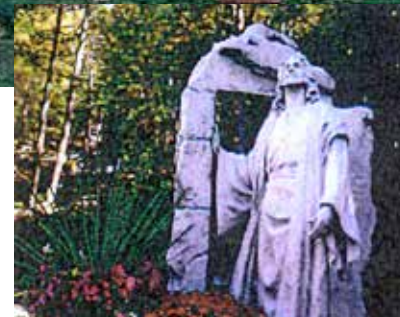
Resurrection statue of hope