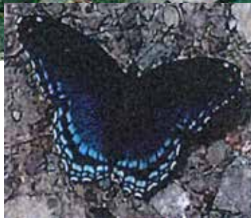
Unique blue butterflies