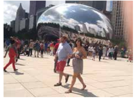
The statue in Millennium Park originally called "cloud gate" but popularly referred to as "the bean"