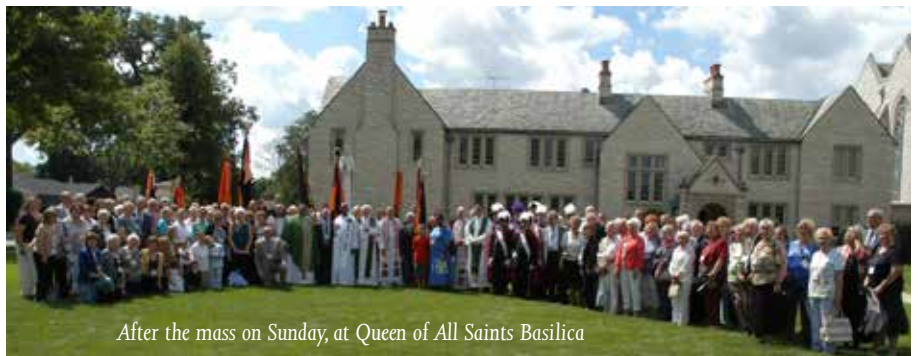
After the mass on Sunday, at Queen of All Saints Basilica