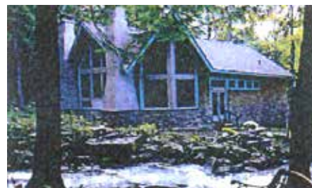
One of a kind chapel