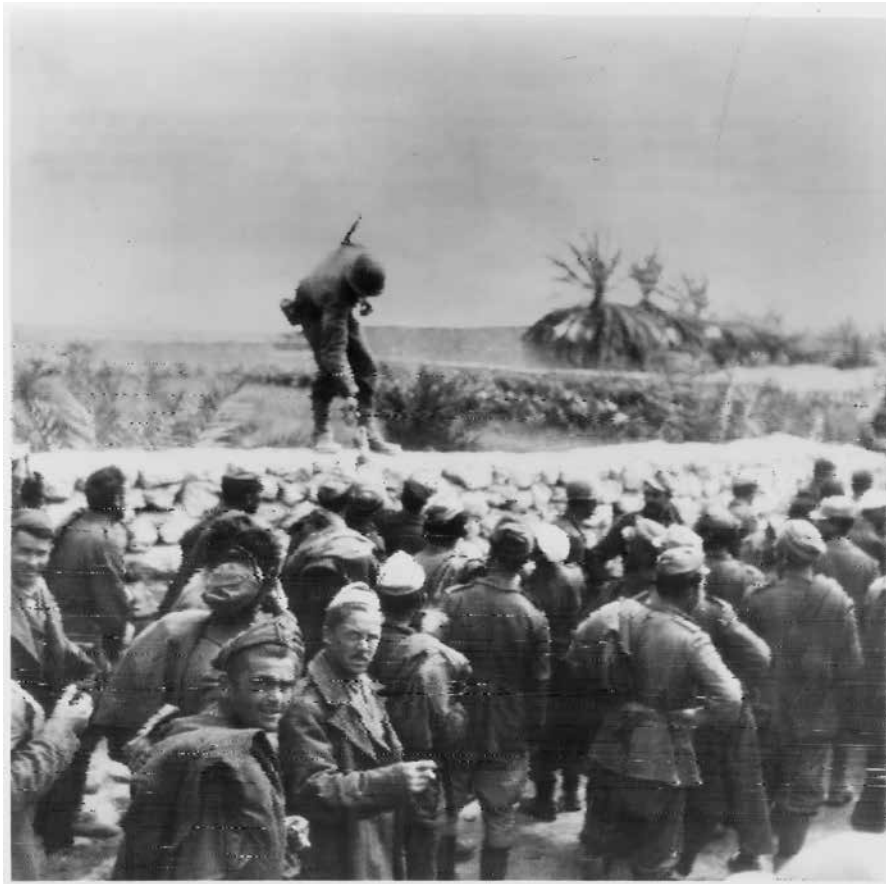
An American soldier hands out cigarettes to captured Bersaglieris of the Centauro Division near El Guettar in March 1943.

Lloyd Fredendall, who had been in command before and during the Kasserine engagement. His first move was to organize his U.S. II Corps for an offensive back toward the Eastern Dorsal chain of the Atlas Mountains. If successful, this would threaten the right rear of the Axis forces defending the Mareth Line facing Montgomery's 8th Army and ultimately make their position untenable. Patton's style of leadership was very different from his predecessor: he is reported to have issued an order in connection with an attack on a hill position ending "I expect to see such casualties among officers, particularly staff officers, as will convince me that a serious effort has been made to capture this objective".