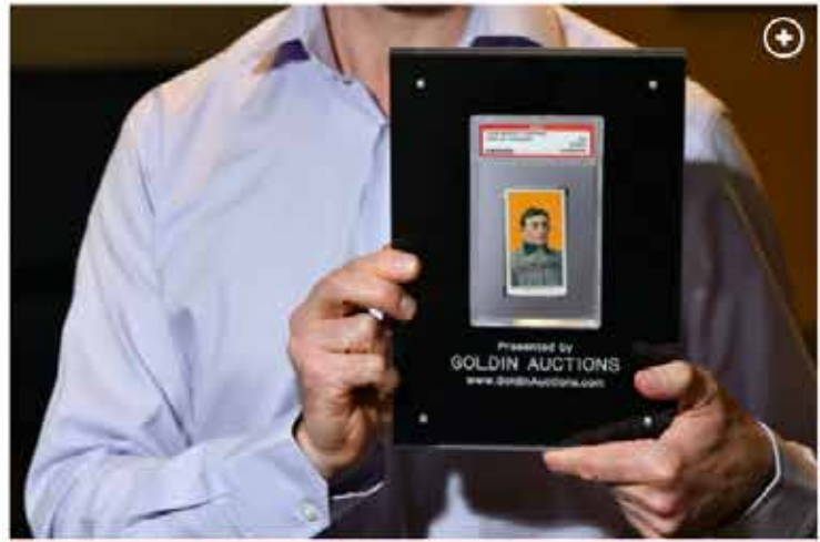
The T206 Honus Wagner 1910 tobacco card.

The world's most expensive baseball card has hit the auction block, and sports fans in Manhattan scored a peek at it Friday.