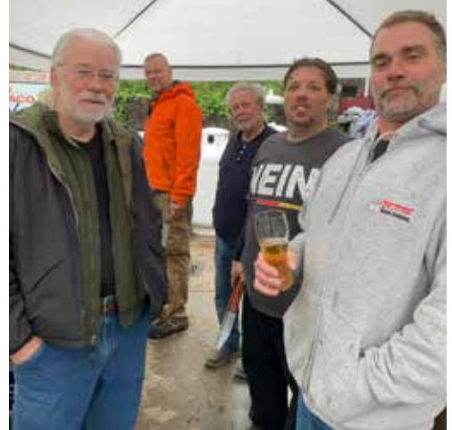
Da Boyz Grillin'