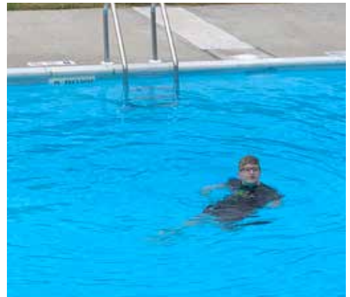
Chillin' in the pool