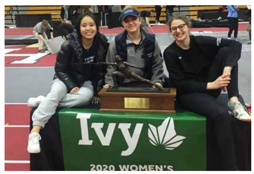
Columbia University Women's Foil Team at the Ivy Championship

SOURCE: Nielsen, Rakuten Intelligence