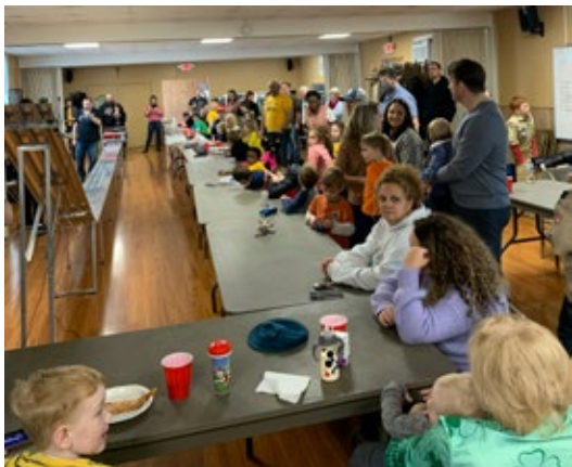
Pinewood Derby at St. Christophers parish hall Sunday March 13

Over the past few months, Troop 36/5036 has had a great deal of new and exciting experiences.